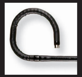
Dual Deflection Up

Optimal accessibility is provided in both kidneys through primary and secondary deflection to both sides. Kidney treatment is made possible by way of dual deflection with a tight radius, allowing an excellent view of the upper and lower poles.